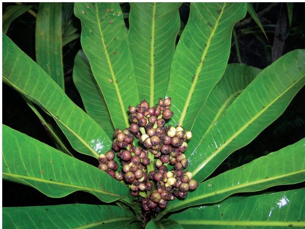
Figure 2. Meryta pastoralis F. Tronchet & Lowry. Photo of female plant in fruit (Photo by Steve Perlman of Perlman 19767).